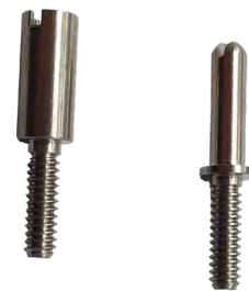
Image depict coding pins required