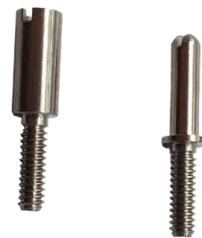
Image depict coding pins required