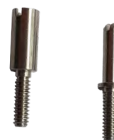
Image depict coding pins required