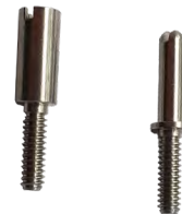
Image depict coding pins required