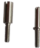
Image depict coding pins required