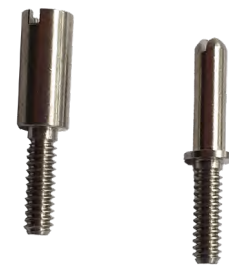
Image depict coding pins required